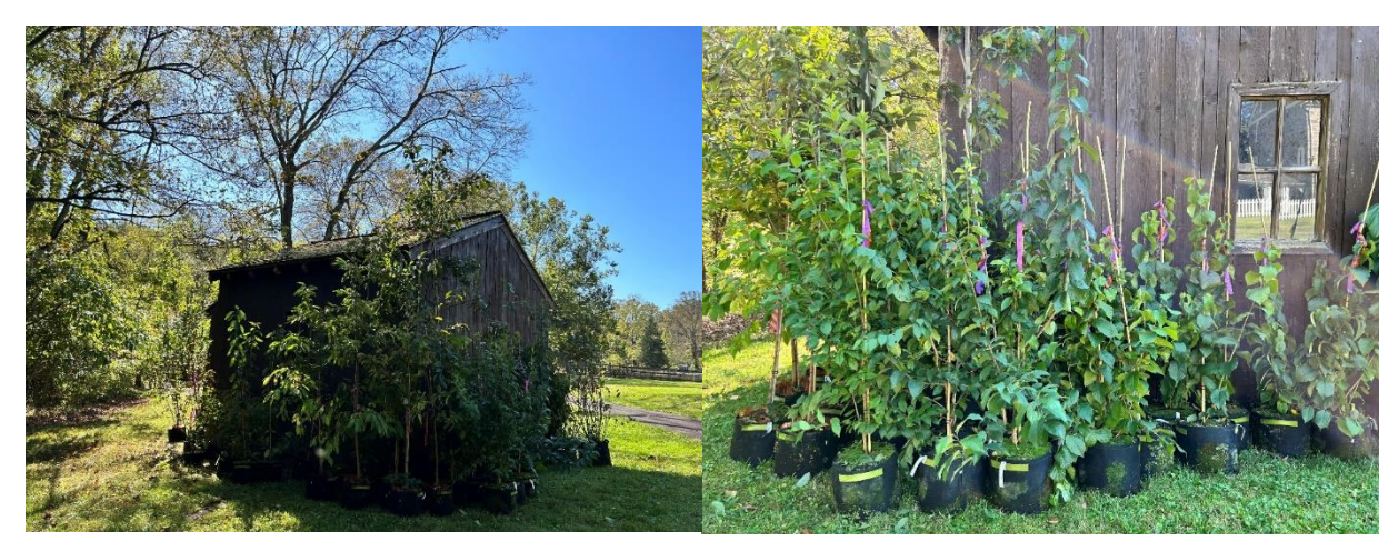
Trees and shrubs purchased with grant funding.