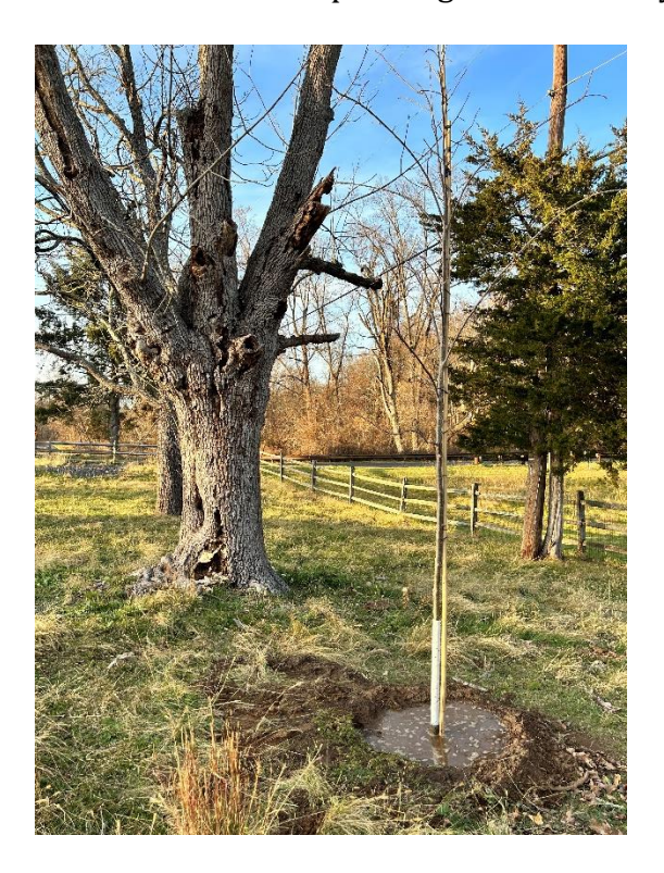
The Oak Tree planted in the pasture, next to the dead ash tree it replaces