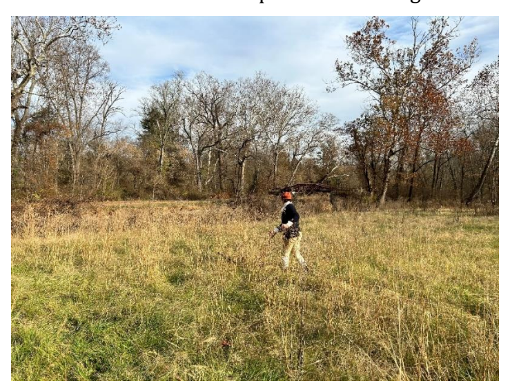
Scythe mowing of a field along the canal, one of the traditional methods demonstrated at the Farmstead.