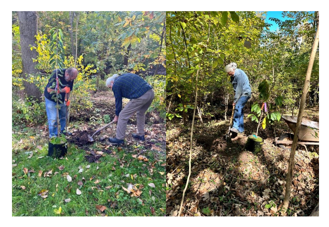
Volunteers planting a Serviceberry (left) and a Pawpaw (right).