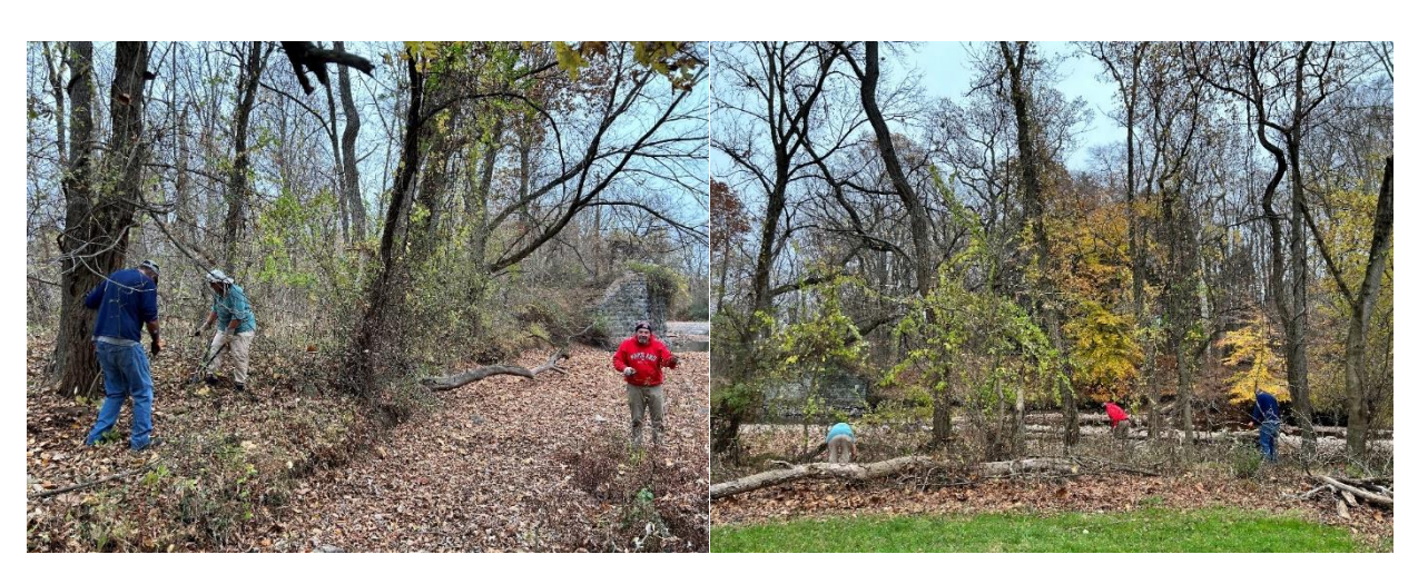
Volunteers clearing invasive vines off of trees along Pidcock Creek.