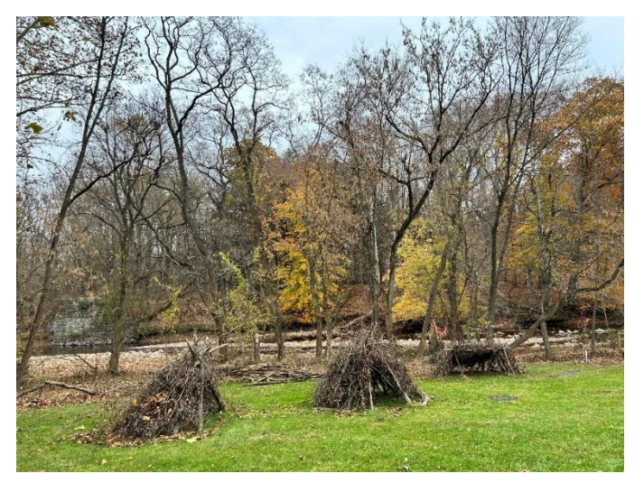
Brush Huts used for the Park's military encampment program in front of the recently cleared creek bank